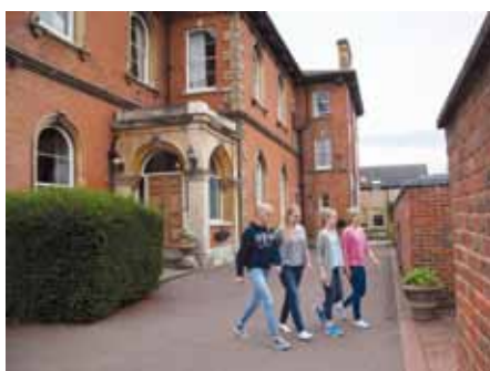
Sample residential timetable